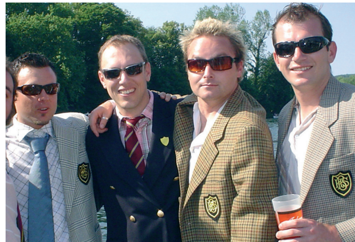
Team Crikey will be flying the Aussie flag in the Staples2Naples rally

Winning the Staples2Naples rally is not just about crossing the finishing line first — it is also about winning as many of the challenges as possible to get maximum points. Elkin said they have no idea what