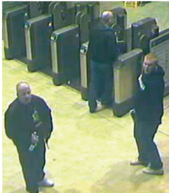
Police are seeking three men, caught on CCTV, who allegedly assaulted a train passenger

All three suspects are described as white men with